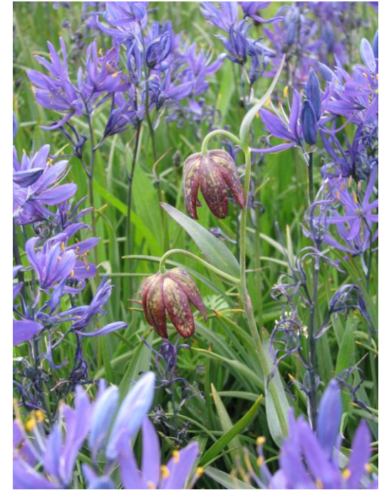
Chocolate Lily with Common Camas

We've designed custom seed mixes inspired by native plant communities that will help you enhance habitat in your own backyard!